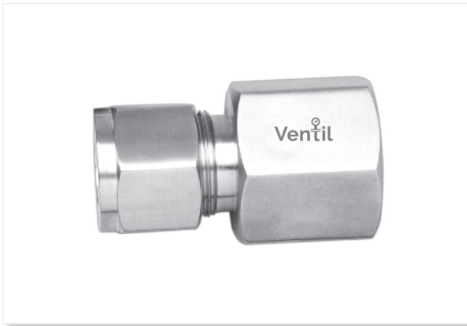
Dimensional Details :